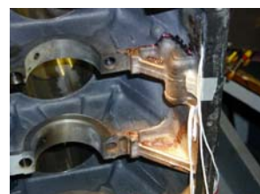
Strain Gauging Steel— Standard Installation