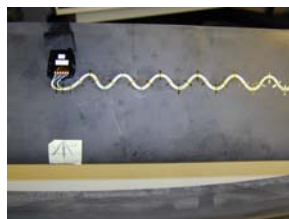
Strain Gauging Plastic—High Elongation