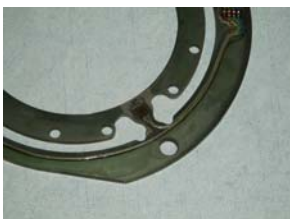
Strain Gauging Steel— Standard Installation

By providing clear details of the project, environment, accuracy, expectations, PCM will provide the ideal project solution.